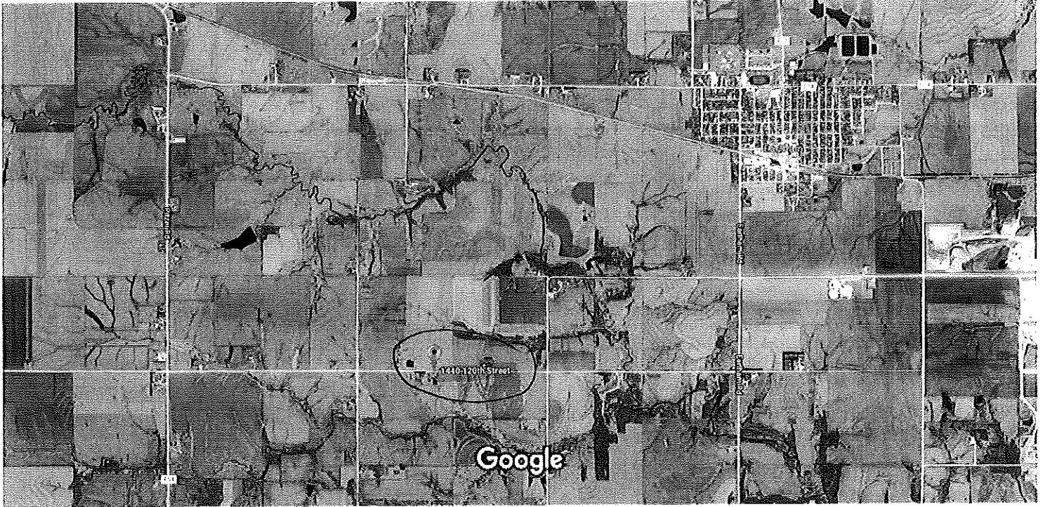
2000 ft