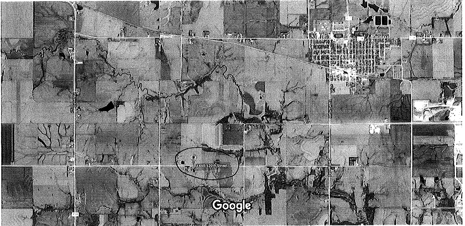
Imagery ©2016 Google, Map data ©2016 Google 2000 ft